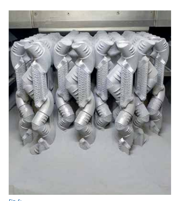
Fig. 5: 120 stacked, nested connectors printed in one process on the SLM®280 by Finnish service bureau 3Dstep Oy.