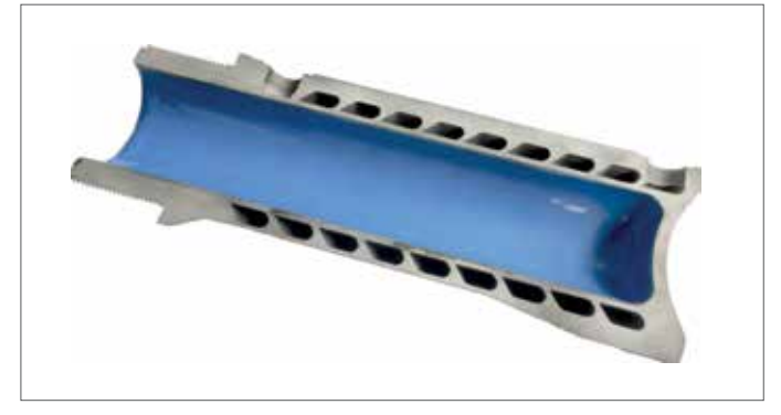
Fig. 1: Prototype, glass-lined high-pressure reactor

The combination of enameling the interior surface and integrated temperature control channels in the reactor's walls provides significantly improved heat transfer than