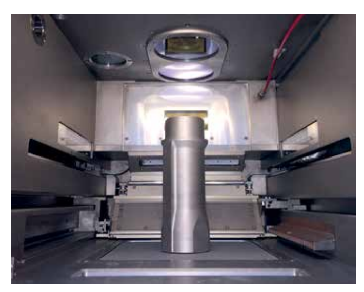
Fig. 4: Reactor built in the SLM*280 selective laser melting machine