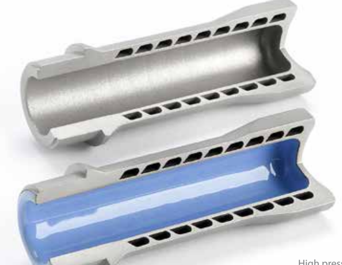
Fig. 5: High pressure reactor before and after enameling