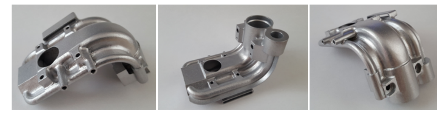
Fig. 4 Optimal component orientation was achieved with the Additive.Designer®