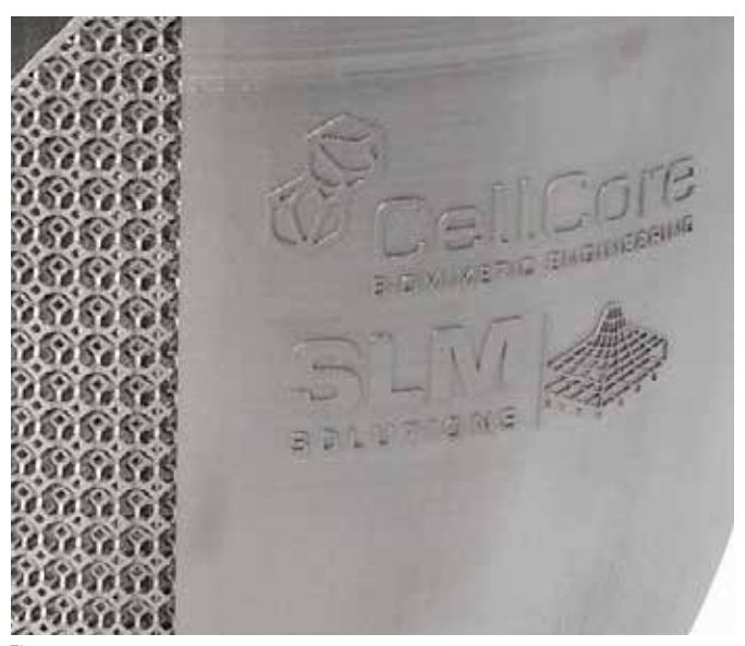
Fig. 1 A joint development project between CellCore GmbH and SLM Solutions

The internal structure developed by CellCore is the fundamental element of the engine and cannot be manufactured by traditional methods. It is not only suited for heat transport, but also improves the structural stability of the component. The cooling properties of the CellCore design considerably outperform conventional approaches, such as right-angled, concentrically