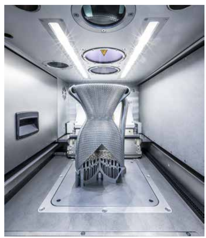
Fig. 4 The one-piece assembly is printed in just over three days on the SLM®280