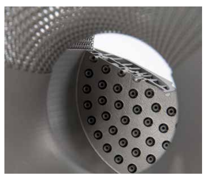
The structural cooling design, developed by CellCore, provides an optimal relationship between stability and mass application of the thrust chamber